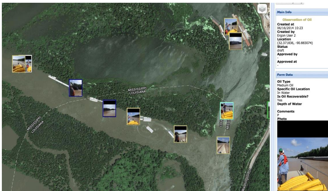
NOAA could use Virtual Badge® to keep track of Remote Natural Resource Assessments as well as the Marine Debris Program

Data collection is a core competency of Virtual Badge® - relied upon for 7 years now, even in areas with no cell and no Internet. Any documentation normally collected with pen and paper can be transformed into electronic forms accessible by the Virtual Badge® mobile application. VB forms standardize information flows and include photo documentation to provide more cohesive intelligence. When forms are completed in the field the submissions are automatically time/date stamped, geocoded, and tagged by the submitter. By collecting data electronically, the timeliness and scope of information gathering is greatly improved. Quicker, more actionable data can result in reduced environmental impact and a greater understanding of the problem. Some examples of data collected by VB in real-world disasters are: critical infrastructure assessments, oil spill sightings, wildlife analysis assessments, scientific environmental impact assessments, safety assessments, floodwater assessments, and various engineering assessments.